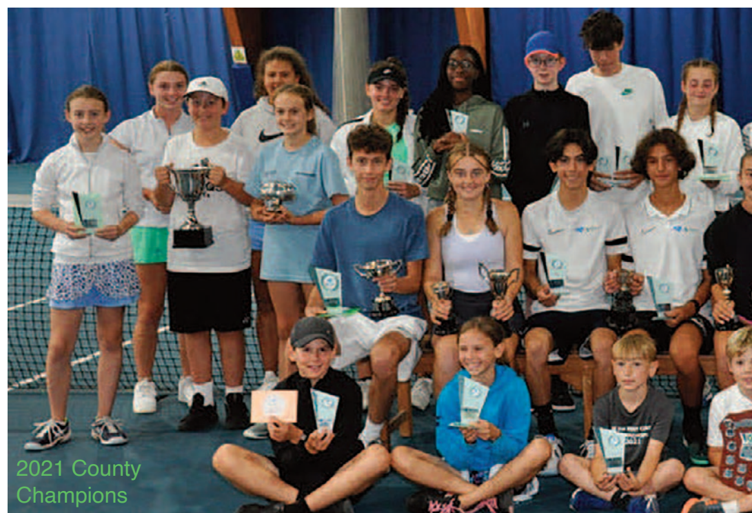
2021 County Champions