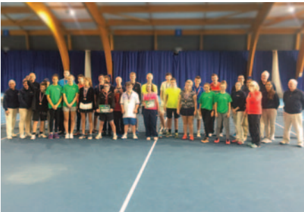
1435 players in disability tennis sessions per month