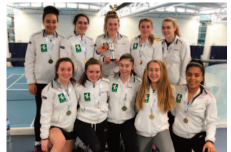
18U Girls – National Champions 10U Boys – National Champions Men's 35s - National Champions