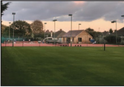
118 registered places to play