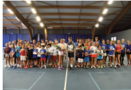
County Championships: 437 players 606 entries, 1091 matches 1956 sets, 18187 games