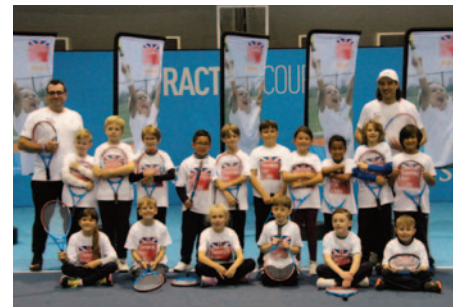
Tennis 4 Kids 1317 children took part 42 Coaches delivered