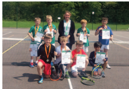
430 school teams played in Kent run competitions