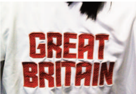
9 players represented Great Britain