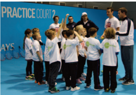
217 Accredited/Accredited+ Coaches