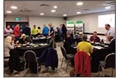
43 Venues attended Autumn Forums