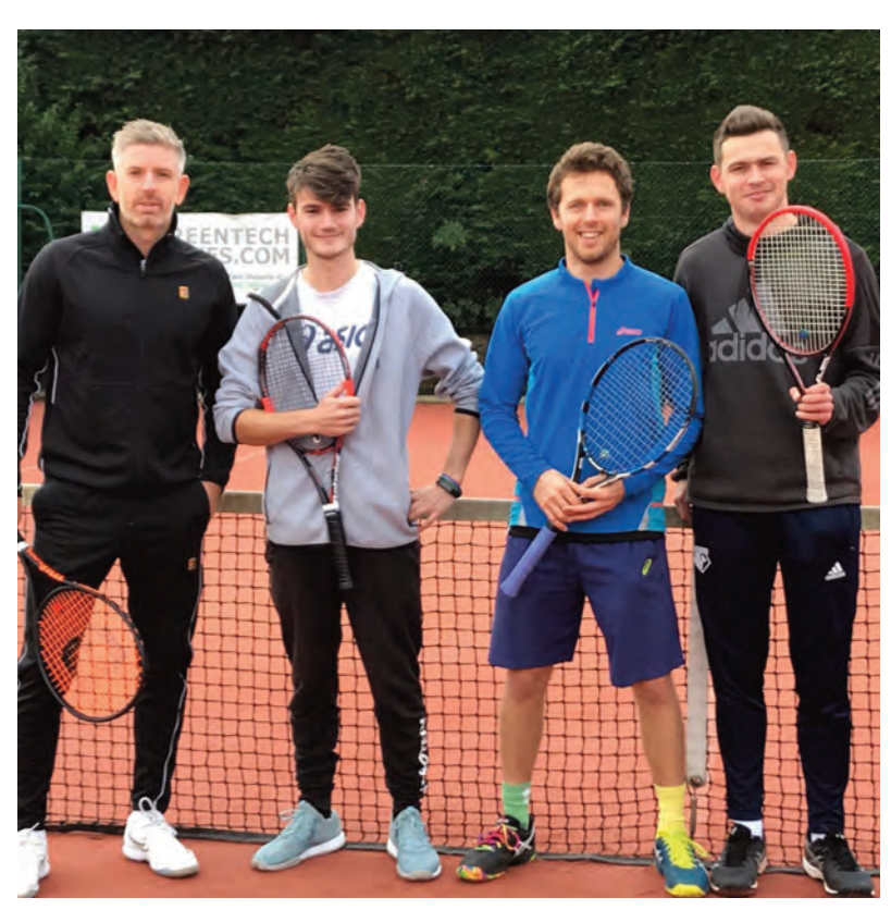
Canterbury Mens 1 - Kent Division 1 Champions 2019