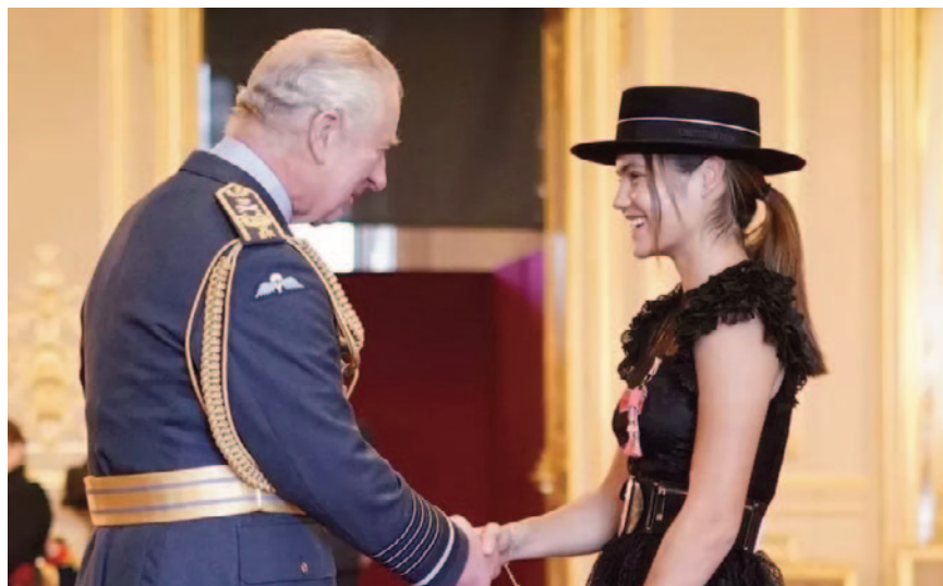
Pictured below is: Emma Raducanu receiving her MBE from King Charles III At Windsor Castle in November 2022