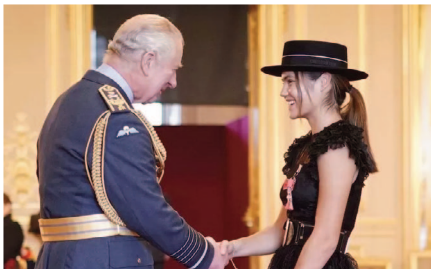
Pictured below is: Emma Raducanu receiving her MBE from King Charles III At Windsor Castle in November 2022