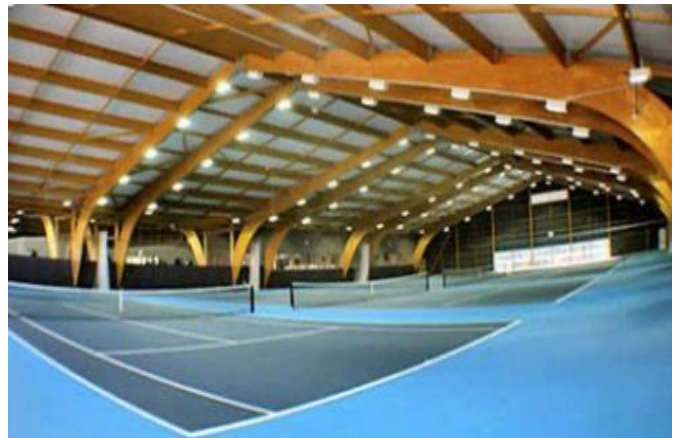
Bromley Tennis Centre